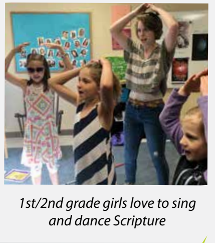
1st/2nd grade girls love to sing and dance Scripture