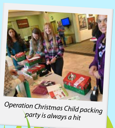
Operation Christmas Child packing party is always a hit