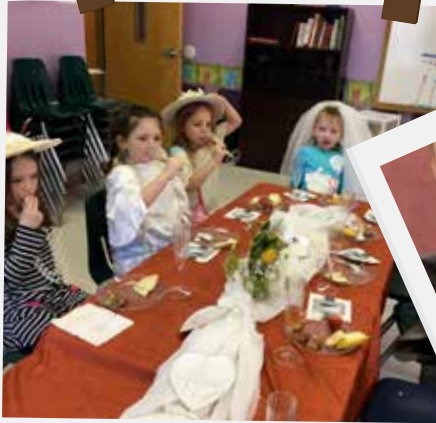
Kindergarten class at the Cana wedding