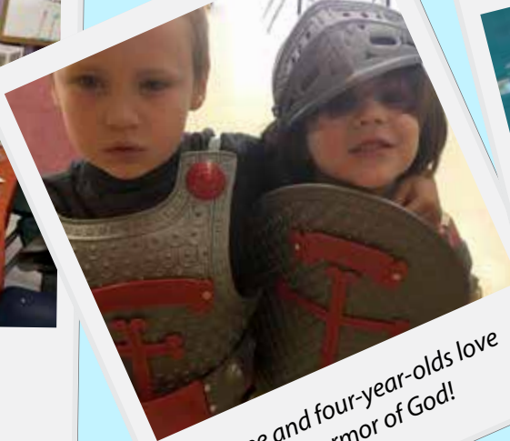
Three and four-year-olds love the armor of God!